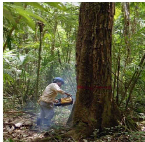
Can risks for investors in REDD be reduced in a way that is in the interests of the poor?

Investment in reduced emissions from deforestation and degradation (REDD) in developing countries relies on the ability to guarantee effective maintenance of forest cover over long timeframes, while also avoiding negative social and environmental repercussions. Given the complex and often unpredictable drivers of deforestation in developing countries, risk reduction is therefore of paramount importance. This paper looks at how REDD transaction mechanisms between buyers and sellers might be established and the implications that risk reduction mechanisms might have for different stakeholders in developing countries. It focuses on the likely implications for the interests and welfare of the forest-dependent poor.