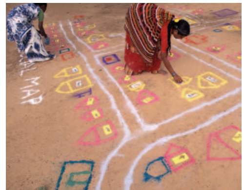
This project in Tamil Nadu, India, helps communities create a visual understanding of their work.

ODI is the UK's leading independent think-tank on international development and humanitarian issues.