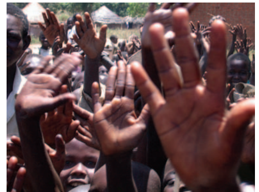
Helping hand? Strengthening aid allocation is a key factor to help deliver the MDGs.

In these discussions, two sorts of disagreement have arisen. One is about principles: what are the fundamental principles according to which aid allocations should be determined? This involves deeper questions about the role of aid and notions of equity and fairness. The